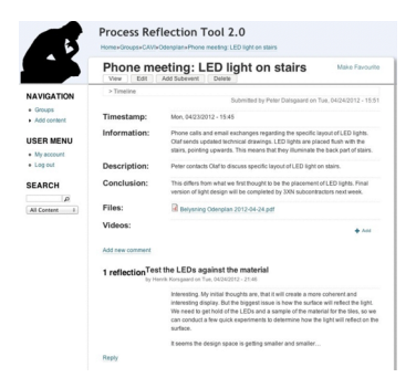
Figure 3 : Screenshot of the Project Reflection Tool, which supports collaborative documentation of and reflection on design processes.

built on hardware that is also primarily built for singleuser scenarios. Even if we take what is likely the most widely known collaborative tool, Google Docs, we find that it is at its core designed as a single-user interface with an added layer of collaborative features. It is clear that there is a large design space to explore in terms of developing systems to support collaborative creativity. Our recent survey of designers' use of tools to capture, manage, and communicate on design ideas [Inie & Dalsgaard 2017] show a similar issue when it comes to interoperability between tools: designers typically use idiosyncratic and dynamically evolving assemblies of tools in their work, yet in practice the integration between these tools, e.g. when it comes to moving between applications, is often time-consuming and causes breaks in the creative flow. While tool developers are starting to address the issue, e.g. via the development of cloud-based collaborative services, the everyday work practices of creative professionals are still dominated by systems and interfaces that are not developed with collaboration and interoperability in mind. Our work combines the development of theoretical perspectives with the development and evaluation of hypothesis-driven prototypes. A few examples from our work include the following: