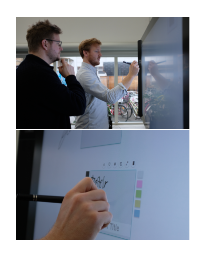
Figures 1+2 : Designers use Cards and Boards system in an ideation session.