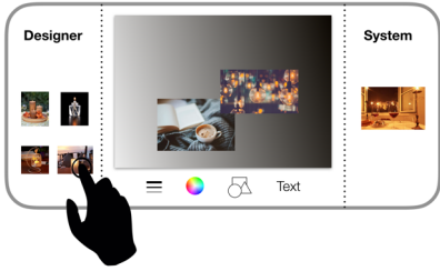
Figure 1: Sketch of the user interface